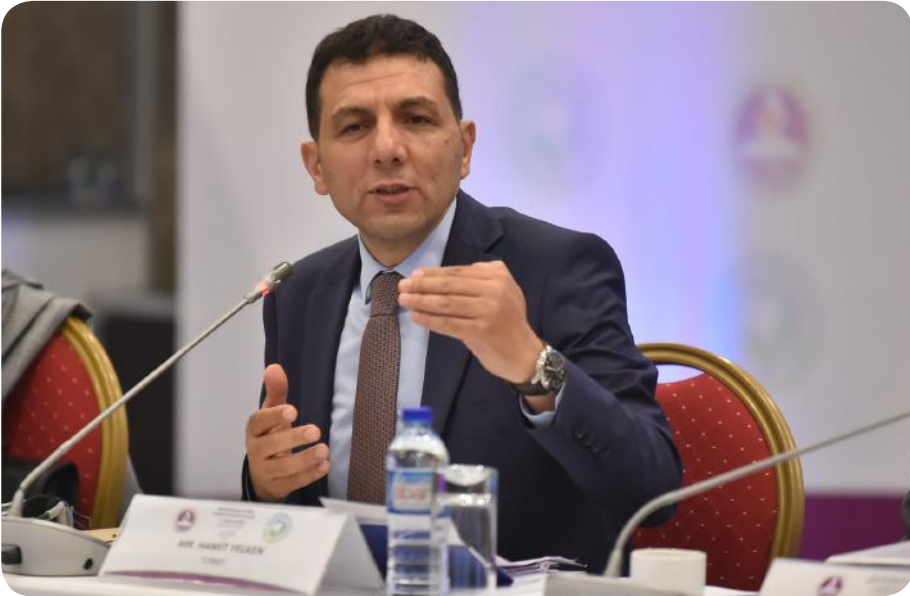
Hamit Yelken, Chief Rapporteur Judge of the Turkish Constitutional Court