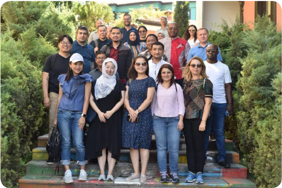
Family Photo from the Social Program, Eskişehir