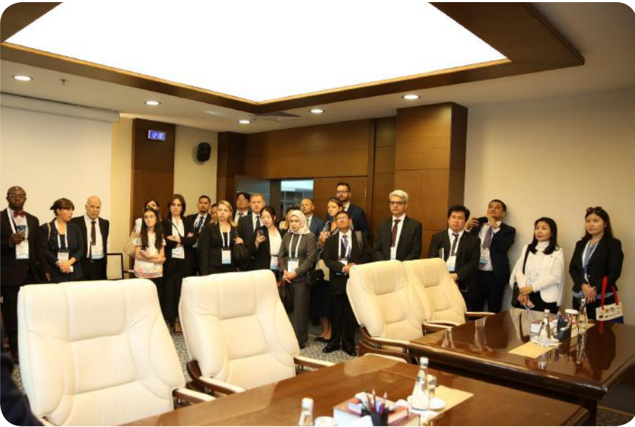
Guided tour of the Constitutional Court of Turkey