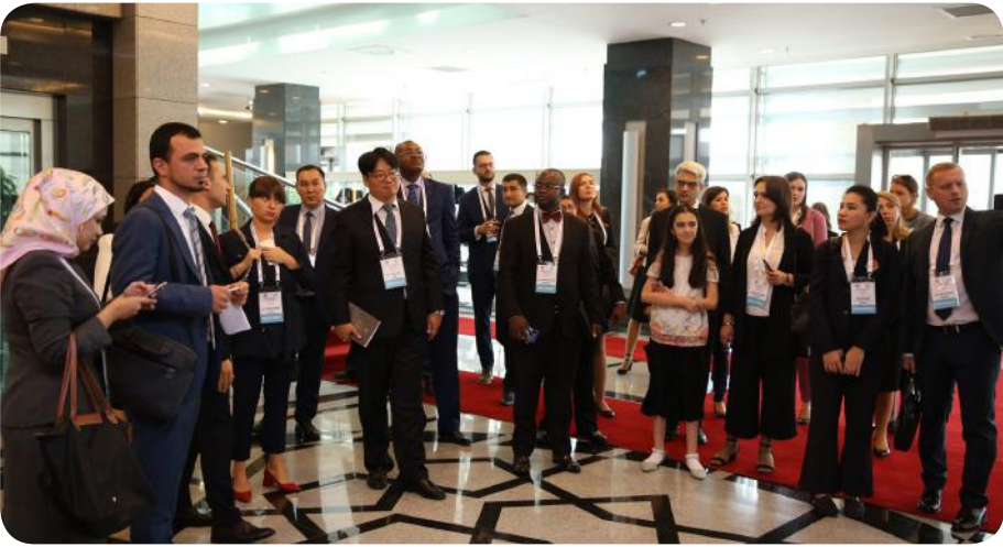
Guided tour of the Constitutional Court of Turkey