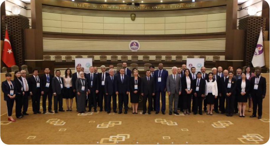
Opening Ceremony, Grand Tribunal Hall of the Turkish Constitutional Court