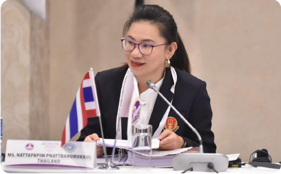
Nattapim Phattranurukul, Constitutional Court of Thailand