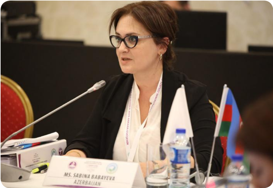
Sabina Babayeva, Constitutional Court of Azerbaijan