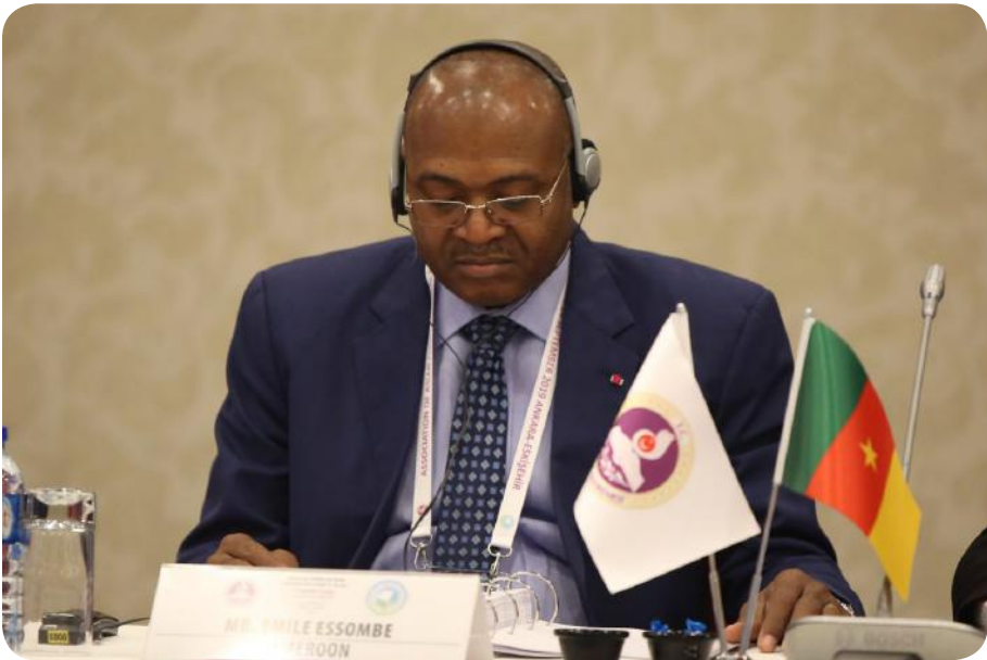
Emile Essombe, Constitutional Court of Cameroon