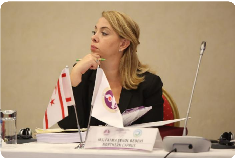
Fatma Şenol Bedevi, Supreme Court of the Turkish Republic of Northern Cyprus