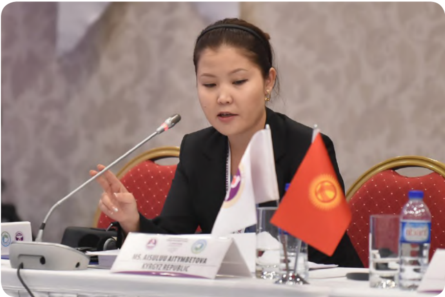
Aisuluu Aitymbetova, Constitutional Chamber of the Supreme Court of Kyrgyzstan