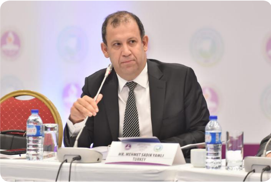
Mehmet Sadık Yamli, Rapporteur Judge of the Turkish Constitutional Court