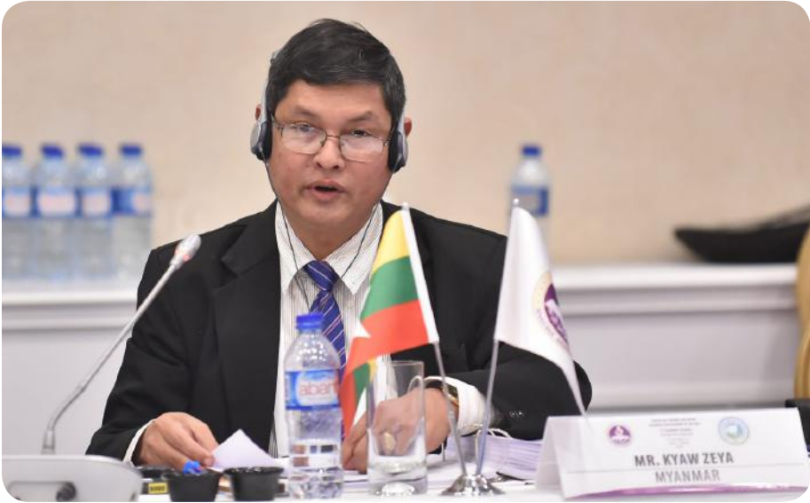
Kyaw Zeya, Constitutional Tribunal of Myanmar