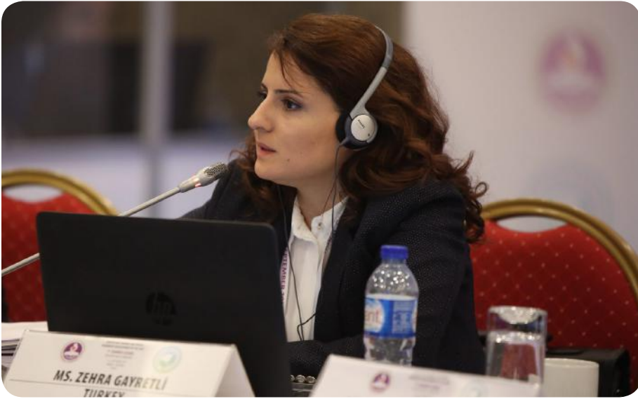
Zehra Gayretli, Rapporteur Judge of the Turkish Constitutional Court