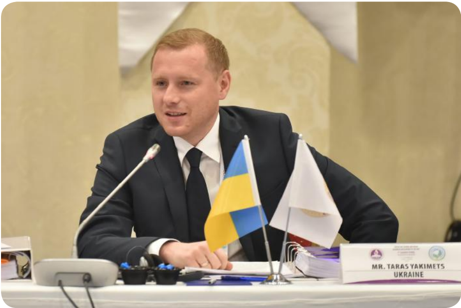
Taras Yakimets, Constitutional Court of Ukraine