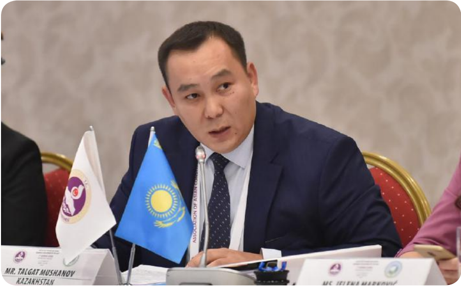
Talgat Mushanov, Constitutional Council of Kazakhstan