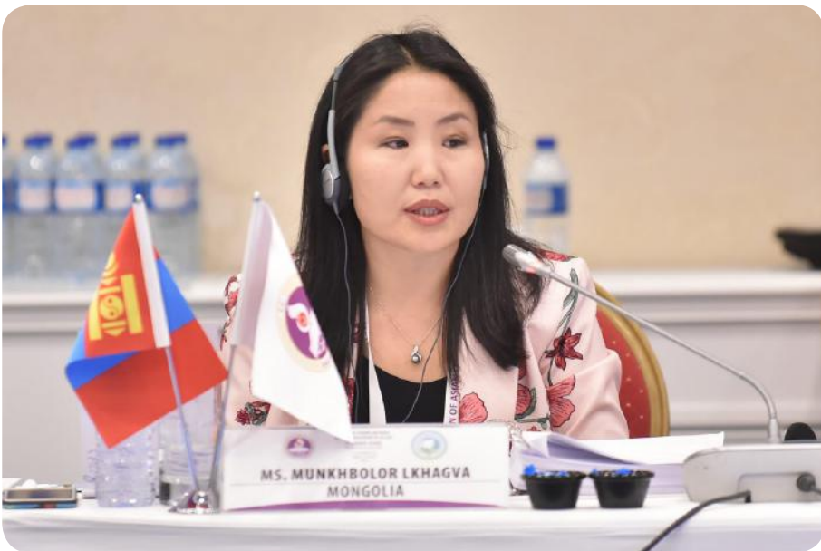
Munkhbolor Lkhagva, Constitutional Court of Mongolia