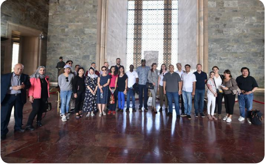
Family Photo from the Social Program, Mausoleum of Atatürk