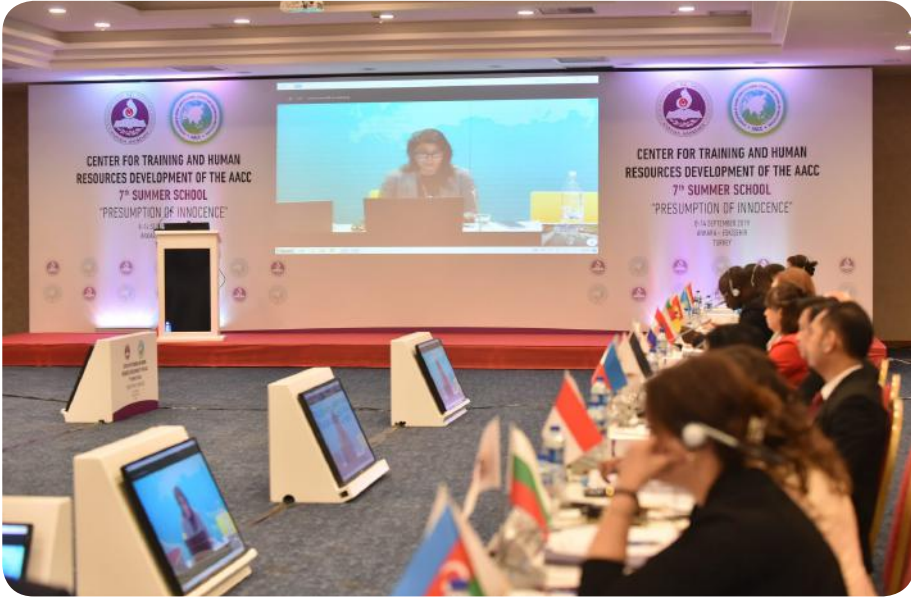
Videoconference, Ms. Zeynep Uçar Tagney, European Court of Human Rights