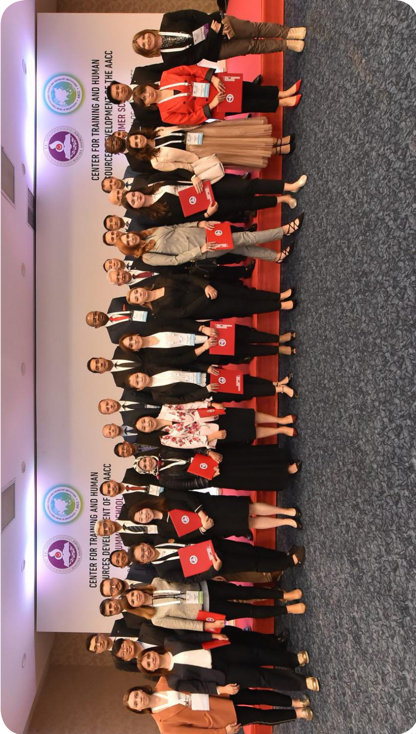
Closing Session of the 7 th Summer School, Conference Hall